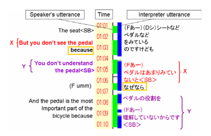
Figure 2: Sample of time chart Example: <X before Y.> (Refer to sec.5.1.1)

with the issue concerning simultaneous interpretation suggested in the previous section, to begin translating simultaneously with speaker utterance is also a task for executing simultaneous machine interpretation. On the other hand. simultaneous interpreters are succeeded in generating Japanese translations simultaneously with English speeches, because they have various kinds of techniques to raise their simultaneity. Professional simultaneous interpreters deal with those difficulties that they face when they follow the utterance order of original speech by using those strategies relating to when-to-say and how-to-say. In this respect, the strategies used by professional simultaneous interpreters are categorized into the following types and interpreting patterns in those strategies are collected from the corpus (Refer to Figure 3).